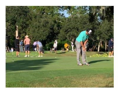
Golfers warming up on the putting green at Wexford Plantation for the Weichert, Realtors<sup>®</sup> - Coastal Properties Golf & Tennis Tournament.